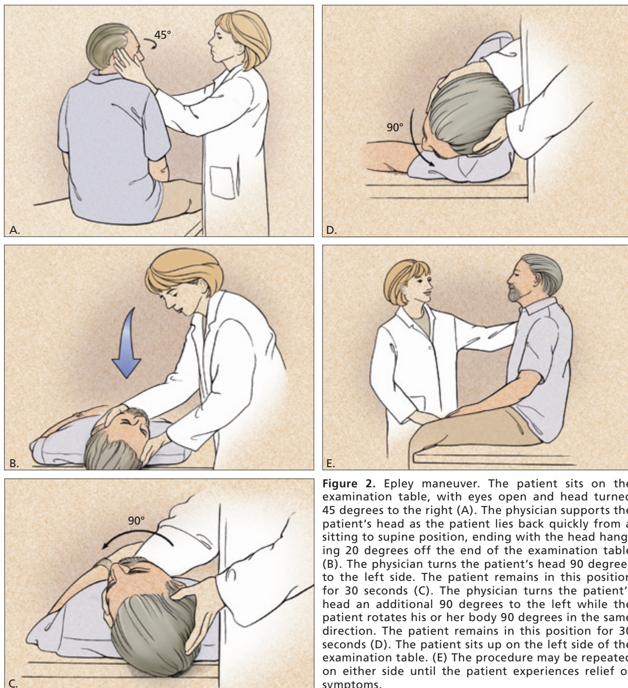
Figure 2. Epley maneuver. The patient sits on the examination table, with eyes open and head turned 45 degrees to the right (A). The physician supports the patient's head as the patient lies back quickly from a sitting to supine position, ending with the head hanging 20 degrees off the end of the examination table (B). The physician turns the patient's head 90 degrees to the left side. The patient remains in this position for 30 seconds (C). The physician turns the patient's head an additional 90 degrees to the left while the patient rotates his or her body 90 degrees in the same direction. The patient remains in this position for 30 seconds (D). The patient sits up on the left side of the examination table. (E) The procedure may be repeated on either side until the patient experiences relief of symptoms.

rence rates of 20 percent at 20 months and 37 percent at 60 months.